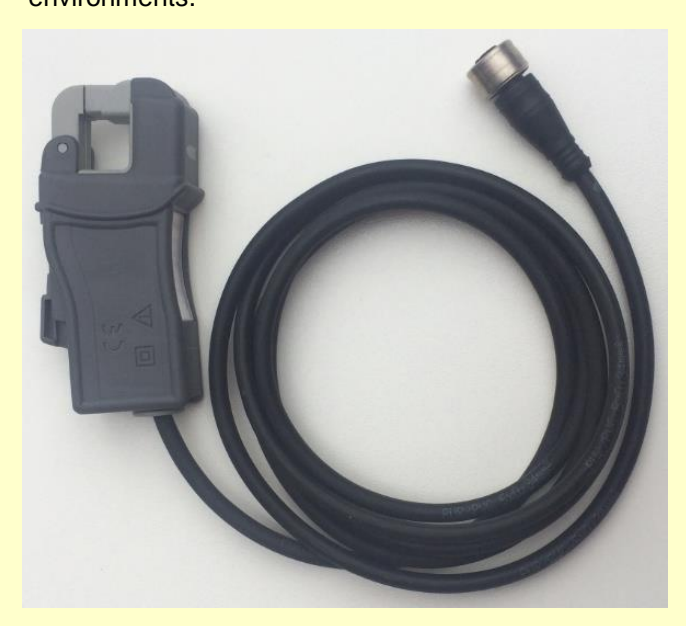
Figure 1: 15 series CAT III 600V current clamp-on probe

The 15 Series CAT III 600V AC Current Clamp-On Probes are a high performance current sensor incorporating a split iron core window current transformer with low ratio and phase errors, specifically designed as an accessory for CHK Power Quality instruments and in CAT III environments.