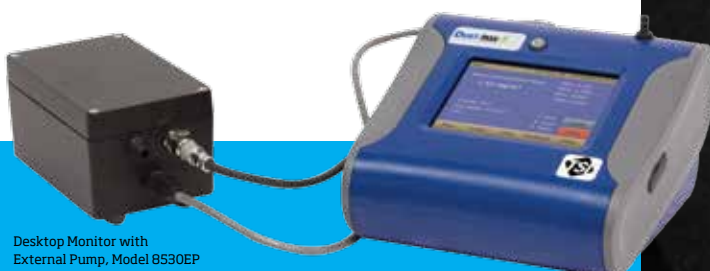
Desktop Monitor with External Pump, Model 8530EP