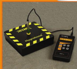
ASTM F 2420