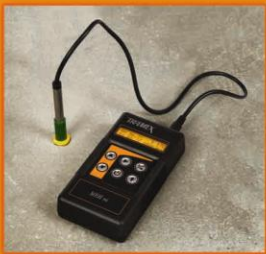
ASTM F 2170