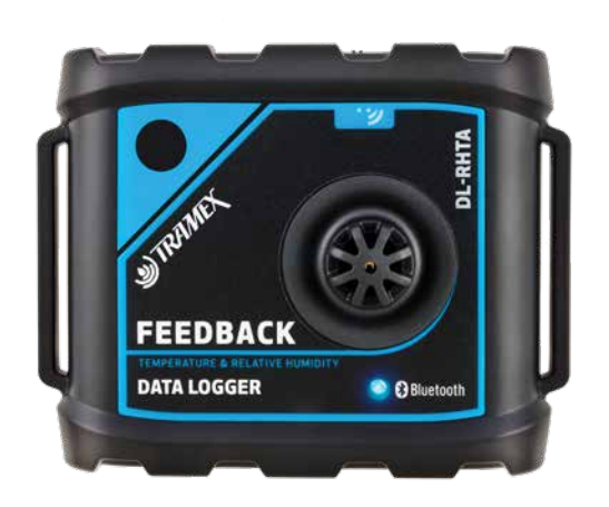
Product order code: DL-RHTA