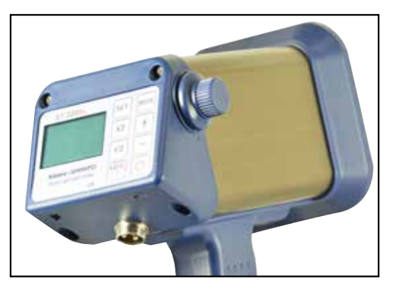
Operation Panel & Flash Adjustment Dial