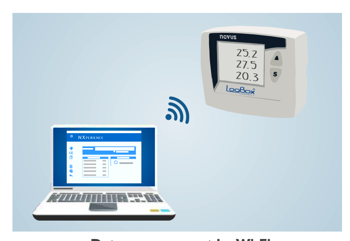
Data management by Wi-Fi

continuous data logging without lack of data, even on link or energy failure. LogBox Wi-Fi can be configured and managed by PC either via USB or Wi-Fi. The NXperience is the free NOVUS software for configuration and data downloading.