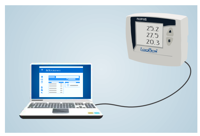
Data management and configuration by USB