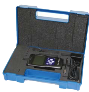
FG-3000 with Accessories in Protective Carrying Case