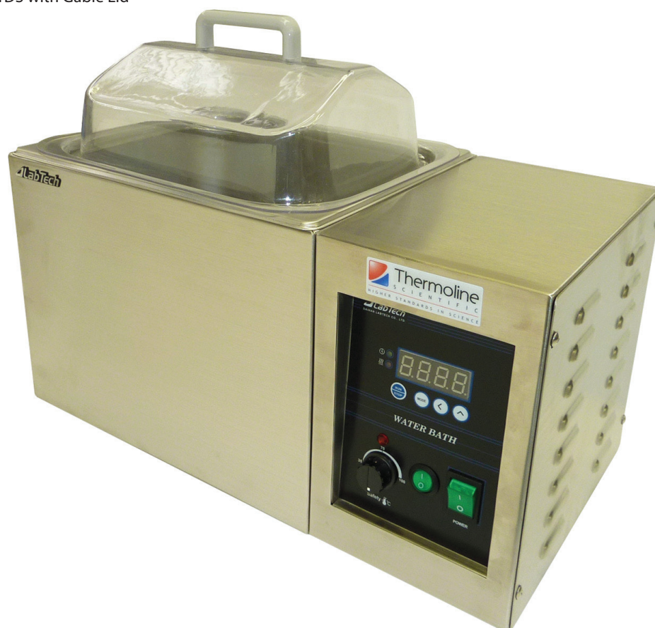
Image: LWB-311DS with Gable Lid