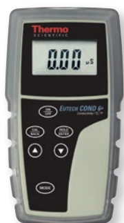
COND 6+ handheld conductivity meter