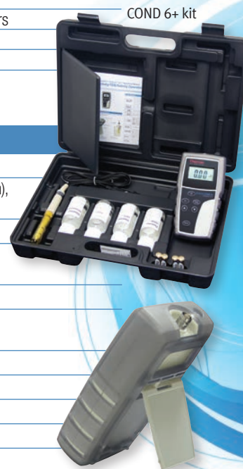
COND 6+ kit Protective rubber armor with benchtop stand