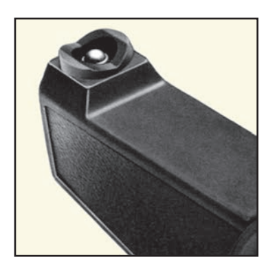
Carbide measuring probe for long life.