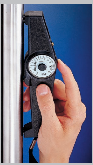
Stable design with additional tail-end support. No annoying rocking during measurement.