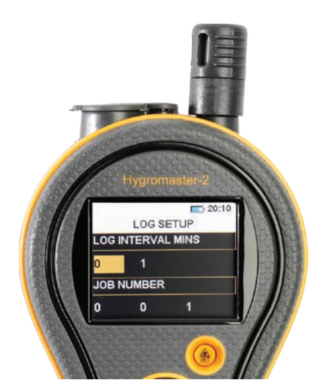
Set interval 1 minute to 24 hours