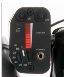
LED display and sensitivity dial