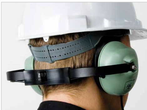
Headset for hardhat use