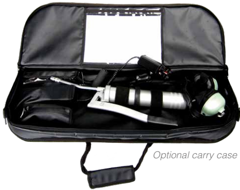
Optional carry case