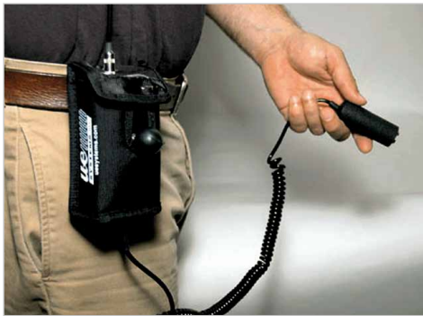
Holster for UP 201