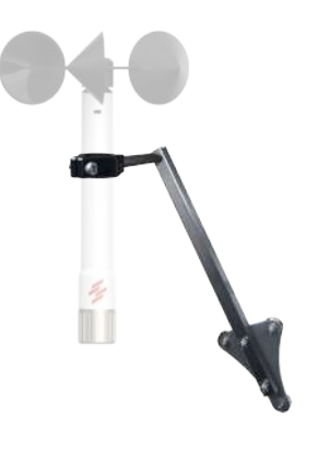
Magnetic Sensor Mounting Bracket