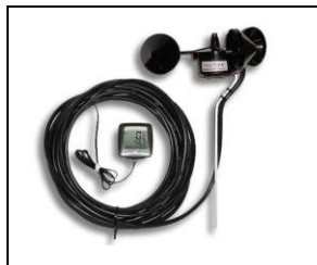
Pole Mount (any length wire)