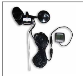
"Flex Wire" (only 25 feet)