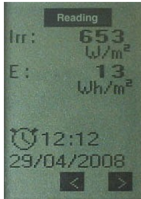
Time-recorded stored values