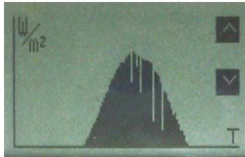
Graphic display 00H /24H

Scrolling of the successive graphs 00H-24H