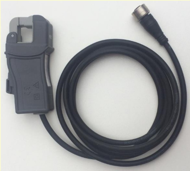
Figure 1: 15 series CAT III 600V current clamp-on probe

The 15 Series CAT III 600V AC Current Clamp-On Probes are a high performance current sensor incorporating a split iron core window current transformer with low ratio and phase errors, specifically designed as an accessory for CHK Power Quality instruments and in CAT III environments.