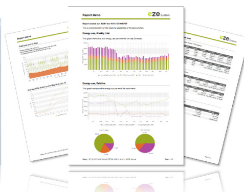
Automatic PDF reports