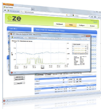
Real time web interface